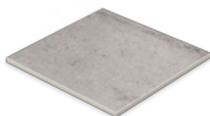
8031, 30 x 30 cm R 10