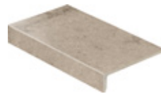
4817 loft stair tread tile® 294 x 175 x 52 x 10 mm, calibrated