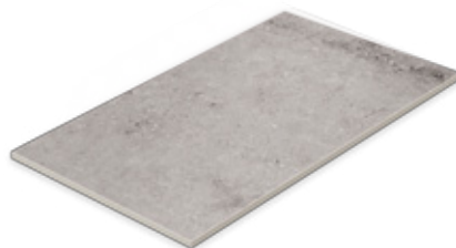
8062, 30 x 60 cm R 10