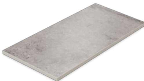
0186, Terrace slab 40 x 80 cm R 10